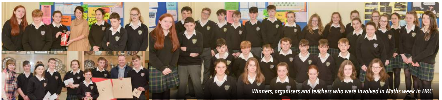
Winners, organisers and teachers who were involved in Maths week in HRC