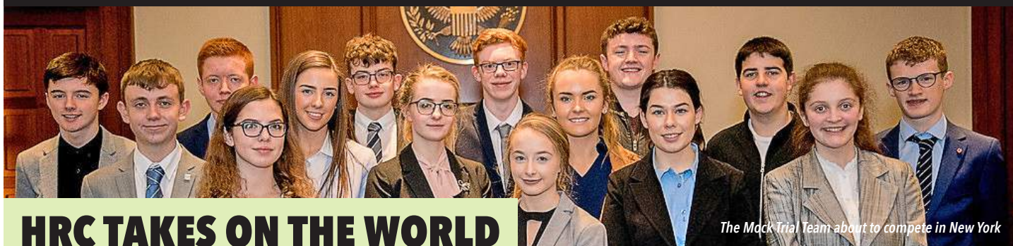
The Mock Trial Team about to compete in New York