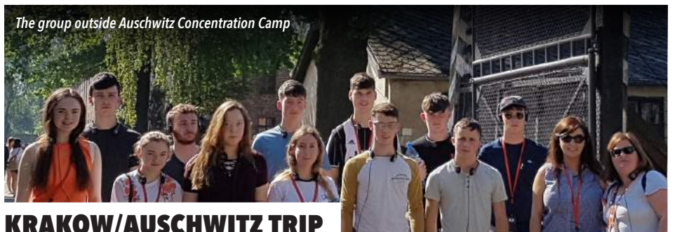
The group outside Auschwitz Concentration Camp

self-esteem. We know that in years to come, the cast and crew will look back with happy memories and will cherish forever the friendships formed and the fun they had in bringing Footloose to capacity audiences. Thanks to all our dedicated staff who gave of their time and expertise so willingly so that our students could have an experience they will never forget. Thanks to our dedicated stage crew, parking attendants, fund raising committee and hair and make-up artists who ensured a smooth running of the show.